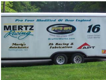
Your logo will be visible as the hauler goes down the highway!

The cars are setup exactly like the NASCAR Whelen Modified Tour. The difference is weight, the maximum weight is 2,000 lbs.